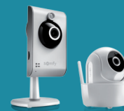
INDOOR CAMERAS VISIDOM IC100 or VISIDOM ICM100