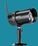
OUTDOOR CAMERA VISIDOM OC100

Somfy created several bundle offers for lighting and security. Ask your dealer for current available offers and get started with building your Smart Home.