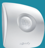
INDOOR MOVEMENT DETECTOR