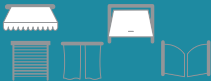
SOMFY MORTORISED PRODUCTS

Compatible equipment depending on your home configuration